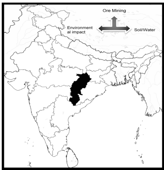
Fig. 1 Map of ore mines located in the state of

This study aimed to identify the effect of iron ore mining and processing on quality of surface water through quantitative determination of trace metals. Study area is located at iron ore mines Rawghat, in the state of Chhattisgarh, India (Fig. 1).